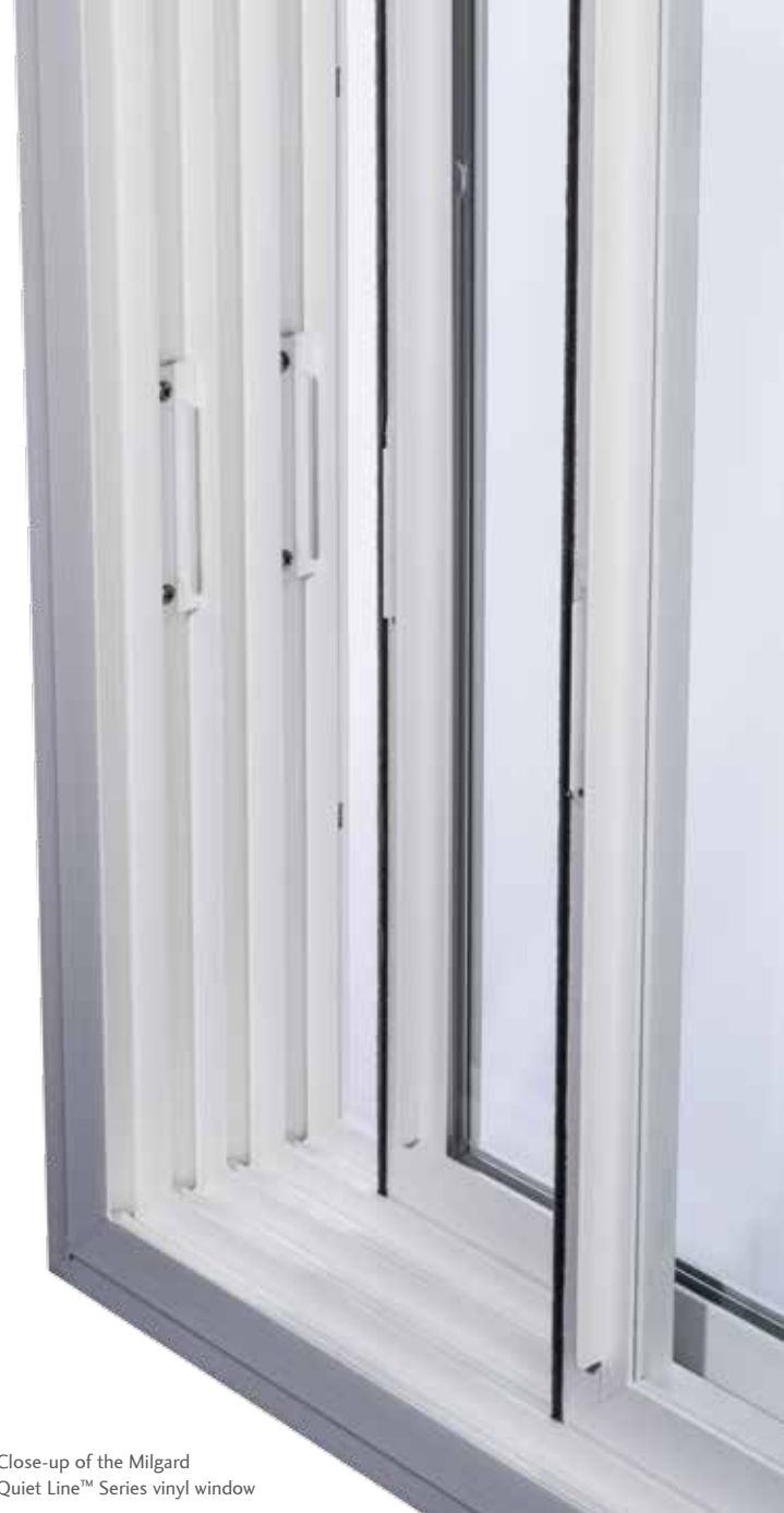
Close-up of the Milgard Quiet Line™ Series vinyl window